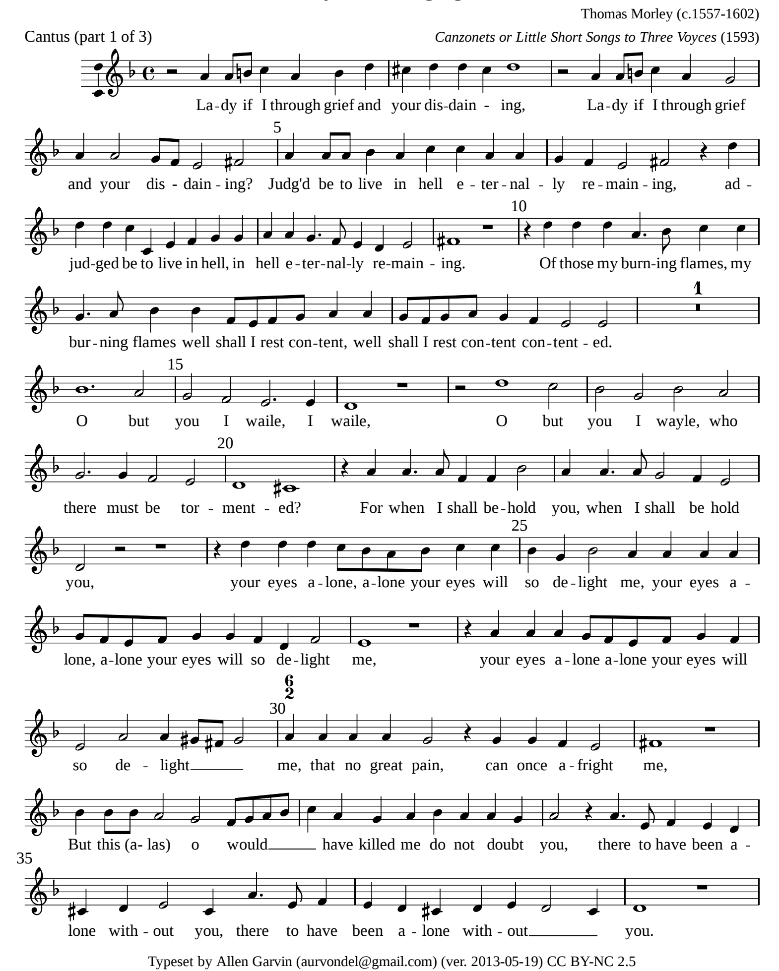
Lady if I through grief